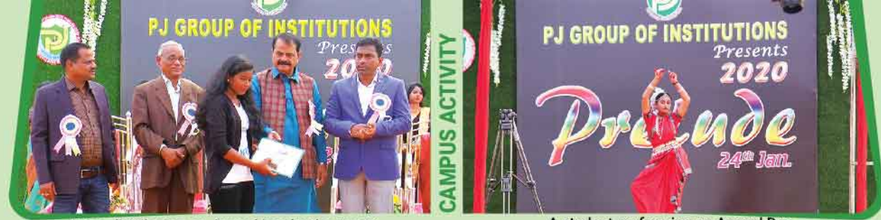
Prize distribution on Annual Day by the Guest